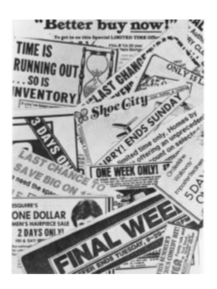
FIGURE 7-3 Don't Wait! Last chance to read this now before you turn the page (ROBERT B. CIALDINI)

scarcity principle is that, by following it, we are usually and efficiently right. 106